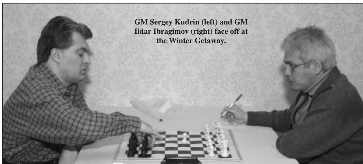
GM Sergey Kudrin (left) and GM Ildar Ibragimov (right) face off at the Winter Getaway.

1.e4 c5 2.d3 Nc6 3.g3 g6 4.Bg2 Bg7 5.f4 d6 6.Nf3 e5 7.Nc3 Nge7 8.0-0 exf4 9.Bxf4 h6 10.Nb5 Ne5 11.Nxe5 dxe5 12.Be3 b6 13.Qd2 Be6 14.Rf2 Qd7 15.Nc3 h5 16.Bg5 0-0 17.Raf1 Kh7 18.h3 Ng8 19.g4 f6 20.Be3 hxg4 21.hxg4 Bxg4 22.Bf3 Bxf3 23.Rxf3 Ne7 24.Qh2+ Kg8 25.Bh6 Bxh6 26.Qxh6 Qg4+ 27.Kh2 Qg5 28.Qxg5 fxg5